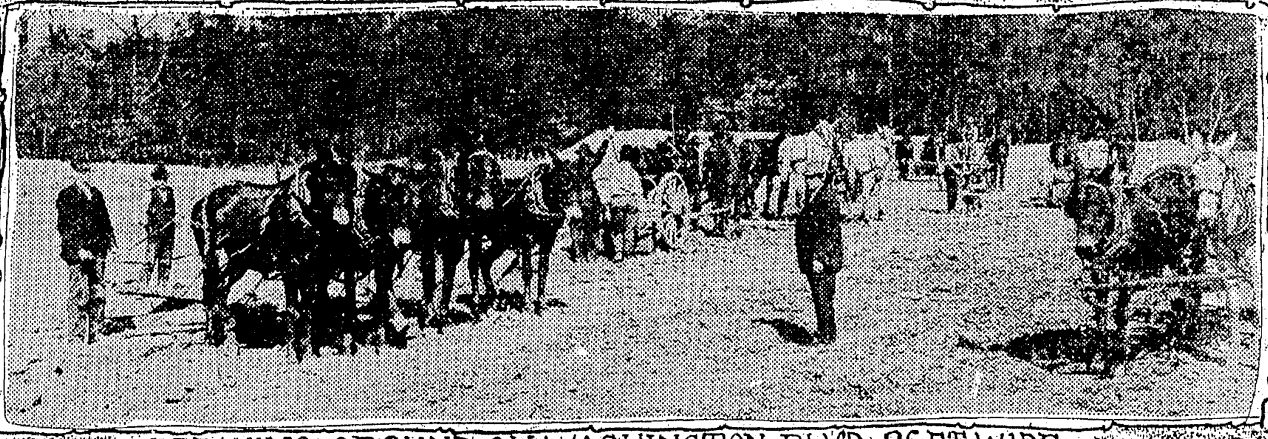
BREAKING GROUND ON WASHINGTON BLVD 86FT WIDE